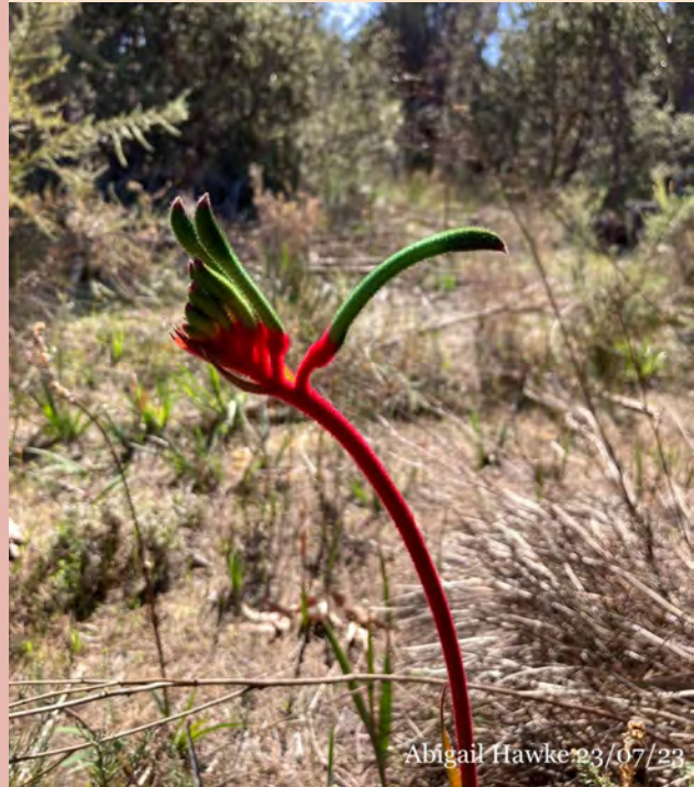
Abigail Hawke 23/07/23